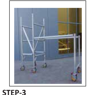
Fit caster wheel in one rung frame and then attached the frame with two horizontal to three rung span frames. Make sure hook facing outside from inside.