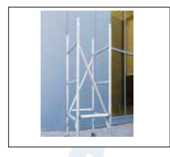
STEP-2 Fit diagonal brace from 1st rung to 3rd rung on sure diagonal brace to